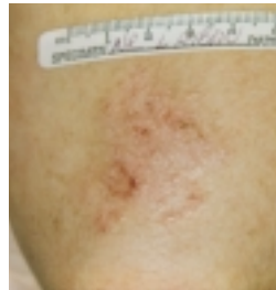
After 3 Treatments 1 Week