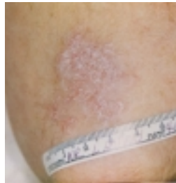
Untreated Psoriasis On Elbow

The sequence below shows the progression of treatments on a psoriatic elbow with the new XTRAC laser excimer system.