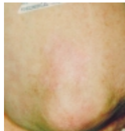
3 Weeks After Sixth And Final Treatment