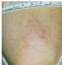
After 6 Treatments 3 Weeks